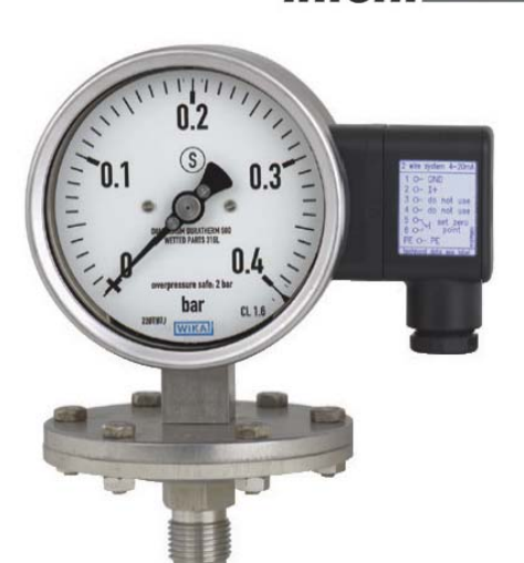
intelliGAUGE Type PGT43.100