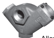
QUICK EXHAUST VALVES

Has two inlets and one outlet. The outlet can be operated by either of two inlets. The first inlet to be pressurized is connected to the outlet, and the second inlet is then closed.