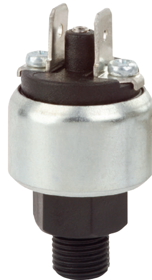
OEM compact pressure switch, miniature format, model PSM04