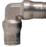
tube to tube