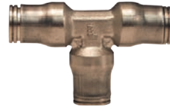
tube to tube