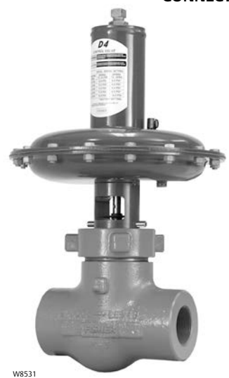
FISHER D4 CONTROL VALVE (NPS 2 NPT END CONNECTION)

■ NACE Constructions—NACE compatible trim is available with the D4 control valve. These constructions meet the metallurgical requirements of NACE MR0175 / ISO 15156.