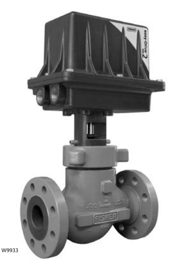
FISHER D4 CONTROL VALVE WITH Gen 2 easy-Drive™ ELECTRIC ACTUATOR (NPS 2 RF FLANGED END CONNECTION)